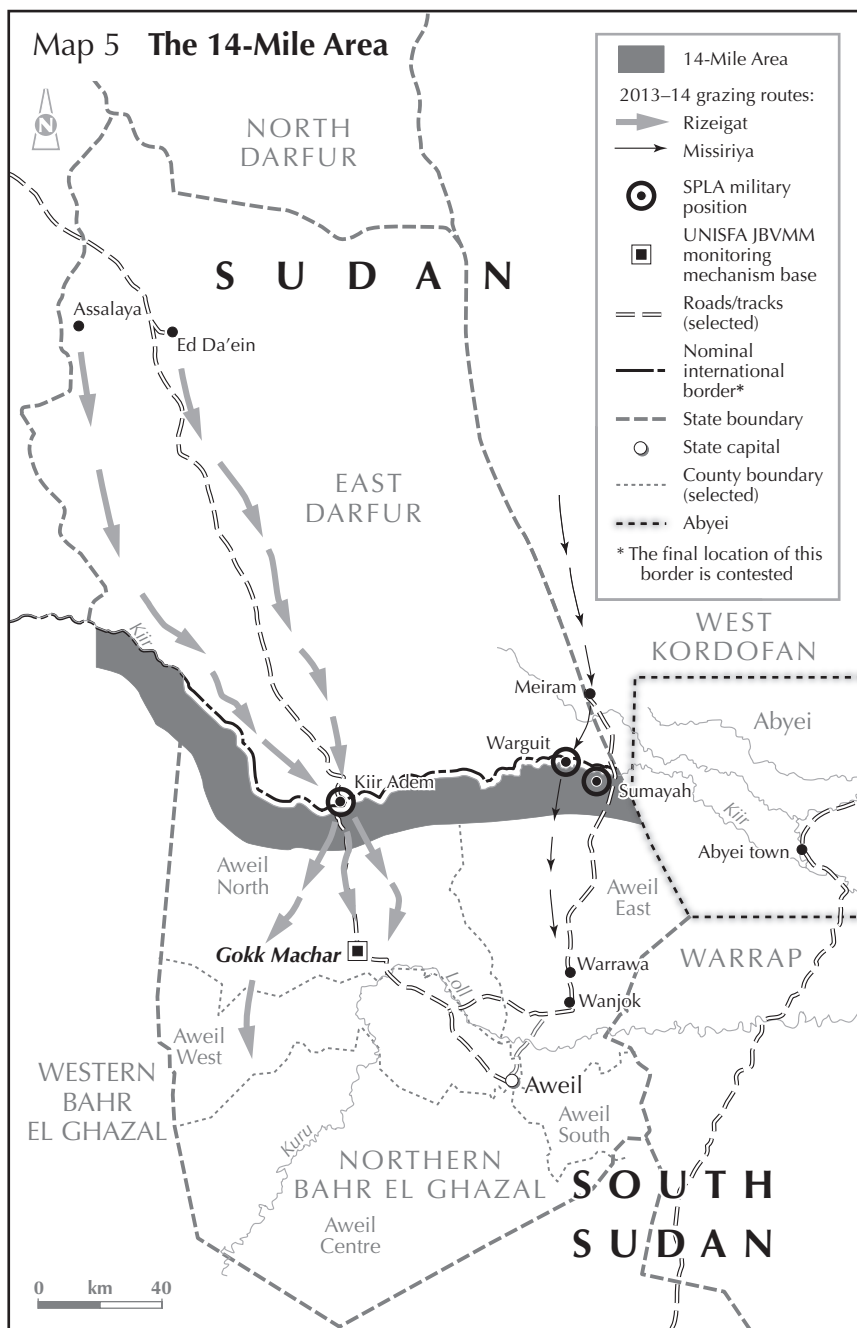
Map 5 The 14-Mile Area